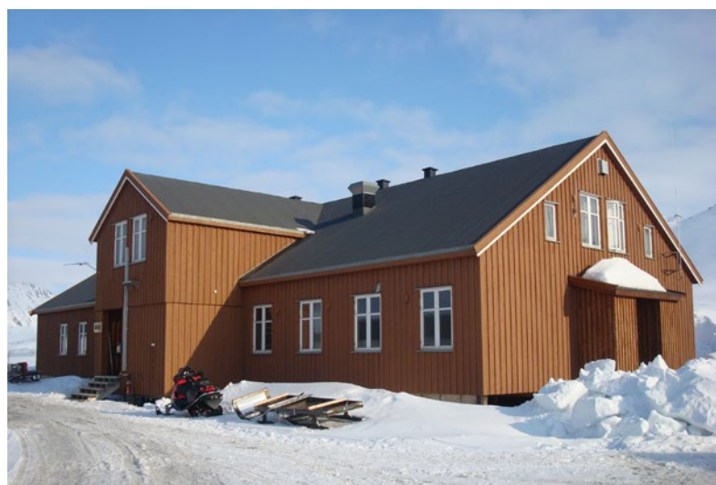
The Italian station from outside.

In Antarctica, international collaboration is promoted by providing access to and hospitality at the Italian stations and by supporting projects that aim to be carried out in non-Italian stations. Italy's main cooperation partners in Antarctic research are France, South-Korea, USA, Chile and Argentina. In the Arctic Italian scientists mainly cooperate with researchers from Norway, Germany, South-Korea, Denmark and Japan.