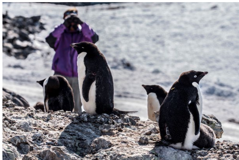
Colony of Adélie penguins at the Dumont D'Urville station, Terre Adélie, East Antarctica, 2015.

At the national level, French polar research is mainly funded through competitive calls which are not dedicated to polar topics. Regarding institutional funding, the calls are issued by CNRS, mainly through its different institutes, the universities, the ANR or, for remote sensing related topics, by CNES. ANR relies on seven Programming Advisory Panels, corresponding to the five national research alliances and two panels on Mathematics and