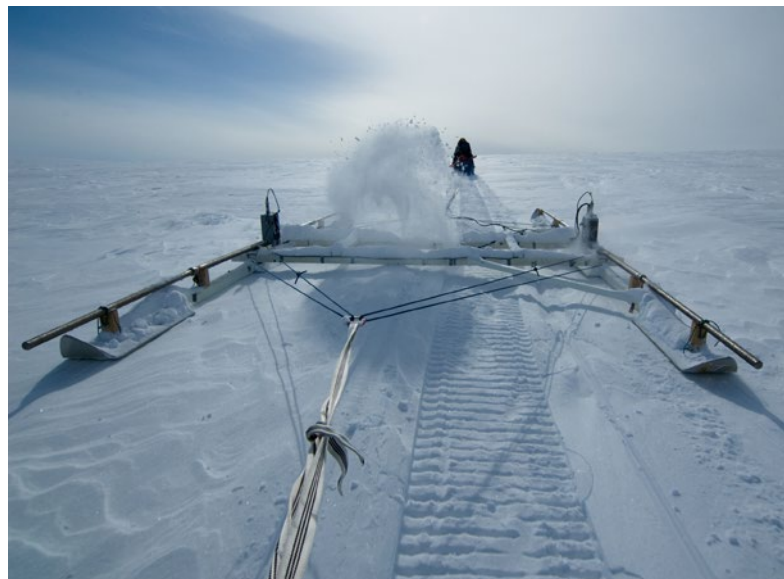
Greenland Zackenberg.

After the International Polar Year 2007/08, Austrian polar research received funding from the Federal Ministry of Science and Research for the strategic development of polar research, which enabled both the Austrian Polar Research Institute APRI and membership in the International Arctic Science Committee to be established.