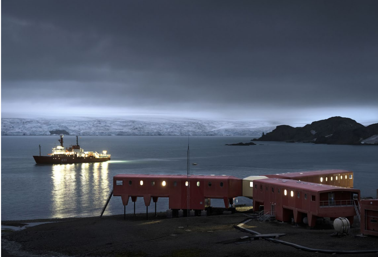
RV Hesperides and Juan Carlos I station.