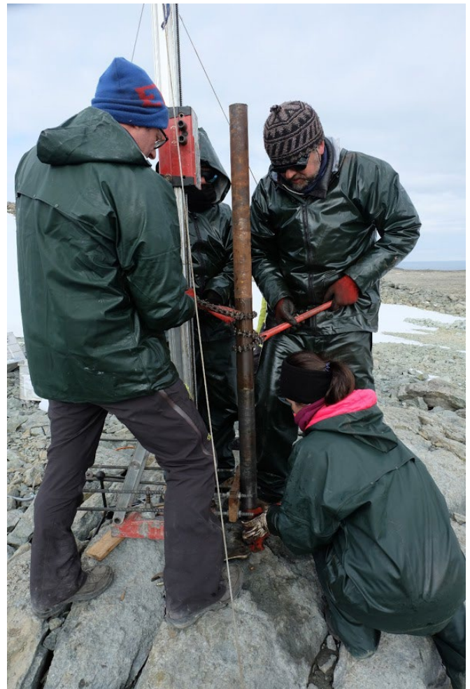
Antarctic Activities Portugal. Photo: Gonalo Vieira

Portugal contributes to the international logistics in Antarctica with an annual freighted flight operating from Chile but has no stations in the polar regions. Hence, international cooperation is essential for national field activities, especially in Antarctica. Since the start of the Portuguese Polar Programme, Spain has been the main cooperation partner, supporting the transport of personnel and equipment, as well as the accommodation of scientists in the Spanish Antarctic stations. This collaboration is framed by a bilateral scientific agreement signed in 2009.