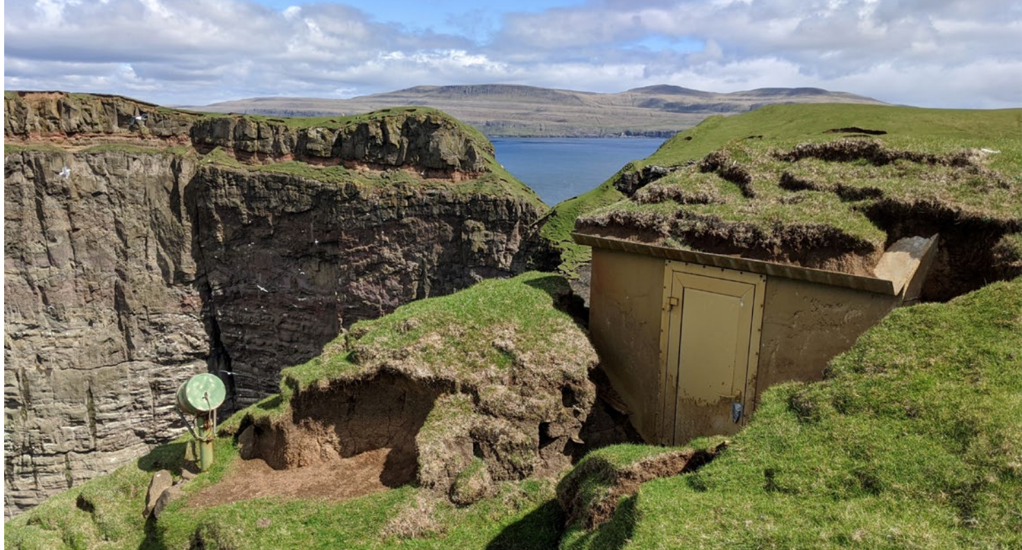
Two Islands called Skúvoy and Nólsoy.

The latest national research strategy and action plan under the headline “Knowledge & Growth” covered the period 2011-2015.