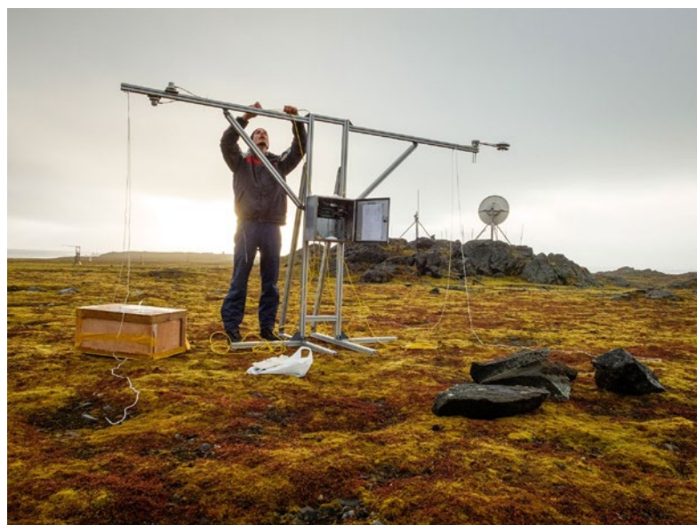
Installation of solarphotometer by Estonian scientist at Polish station Hornsund on Svalbard.

In the EU projects DAMOCLES and within the international MO-SAiC expedition, Estonia cooperated with the AWI (Germany), the Finnish Meteorological Institute (Finland), Bern University (Switzerland), Heidelberg University (Germany), Hefei University of Technology (China) and with Argonne National Lab (USA).