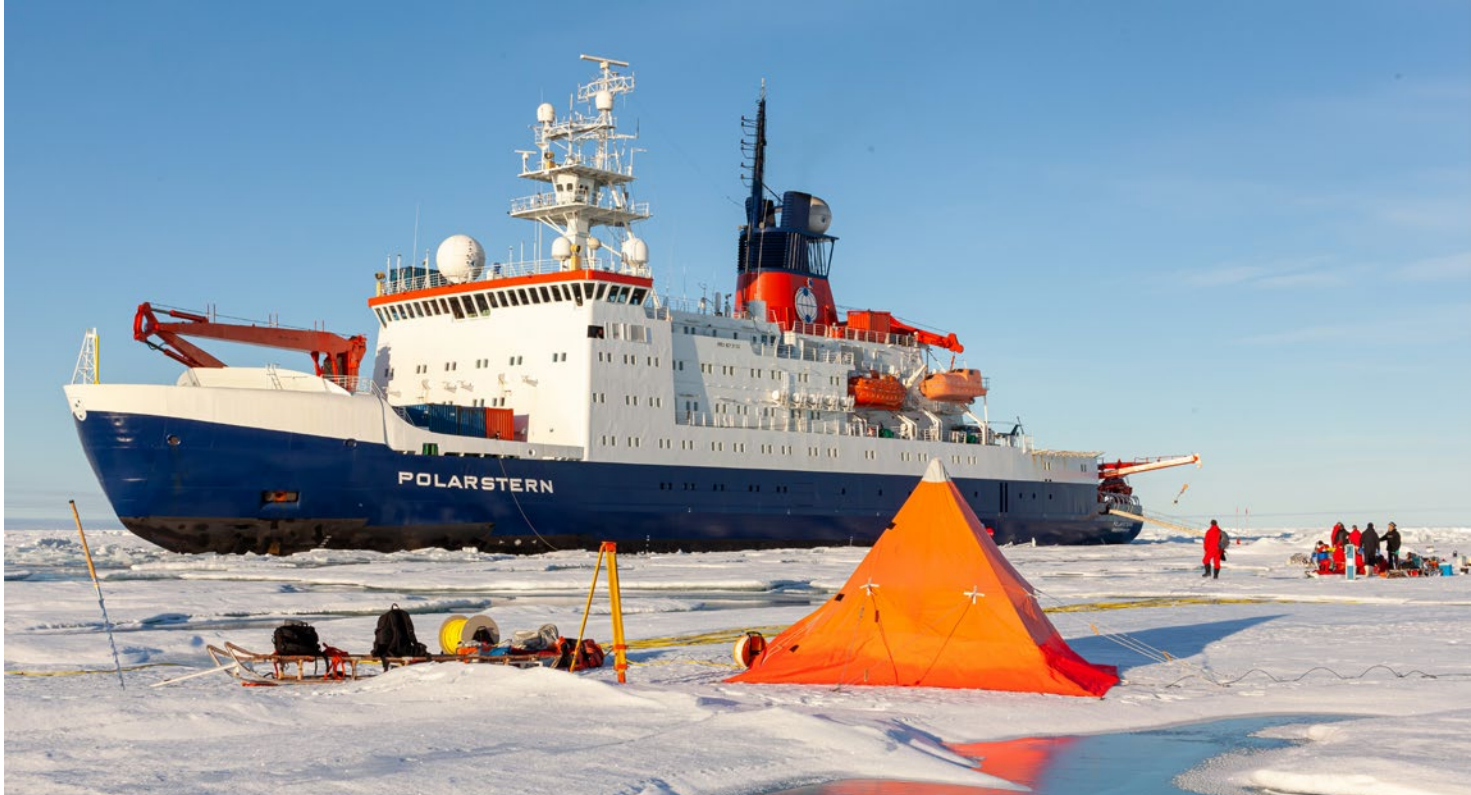
Ice station work during the RV Polarstern expedition "TransArc" in the central Arctic Ocean in summer 2011.