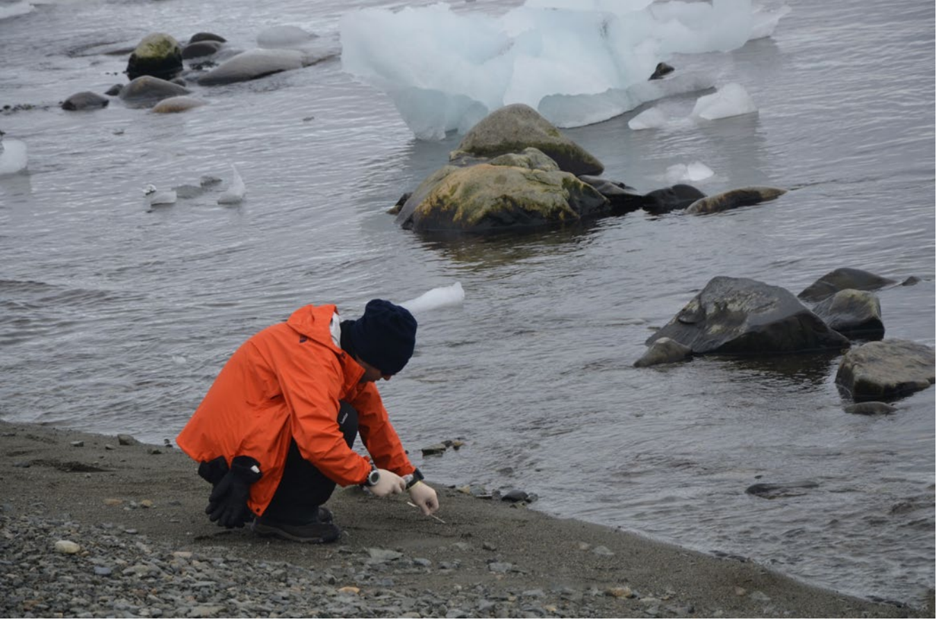
2016-2017 Antarctic Season, Antarctic Peninsula.