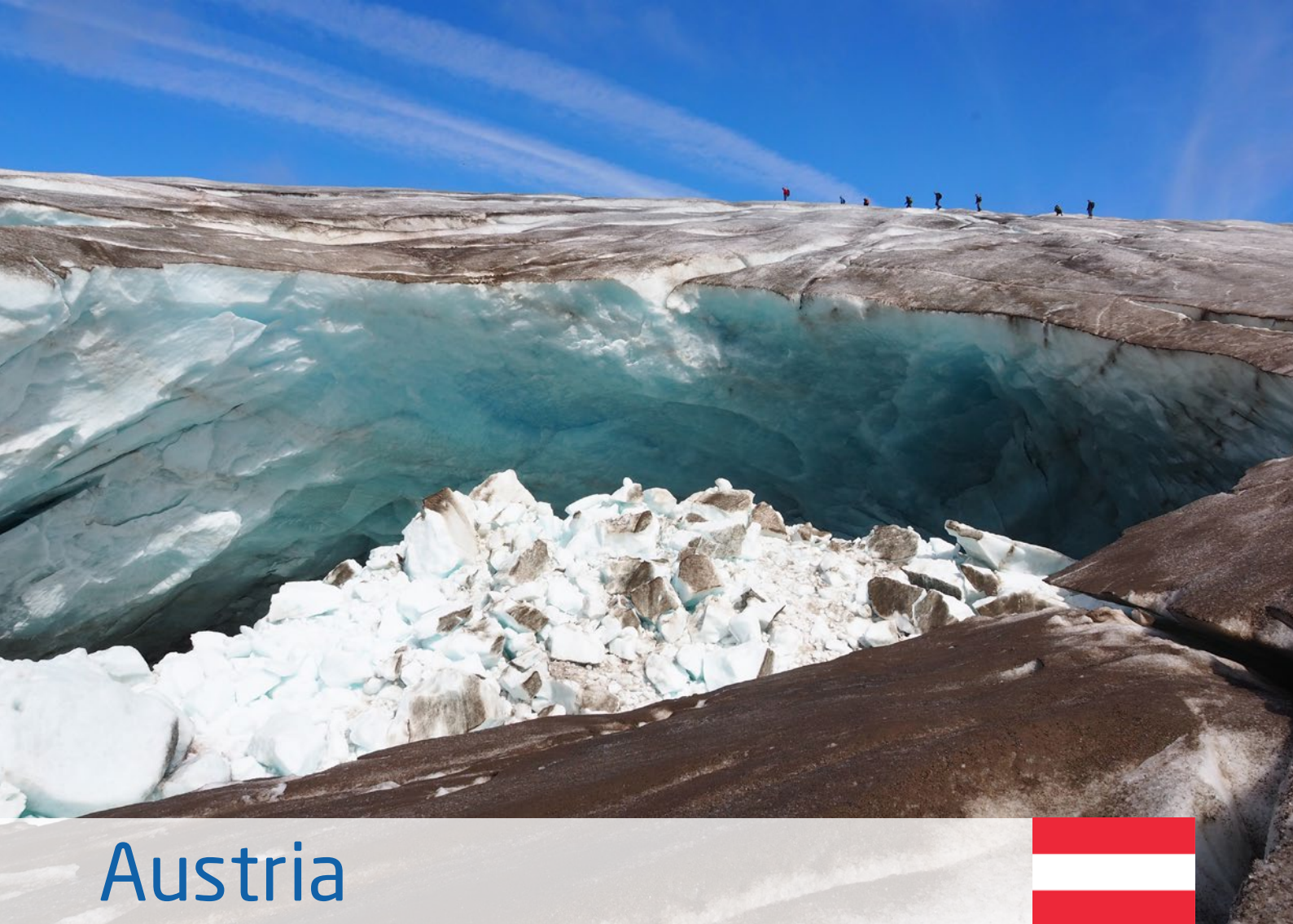
Greenland Mittivakkat c Glacier.