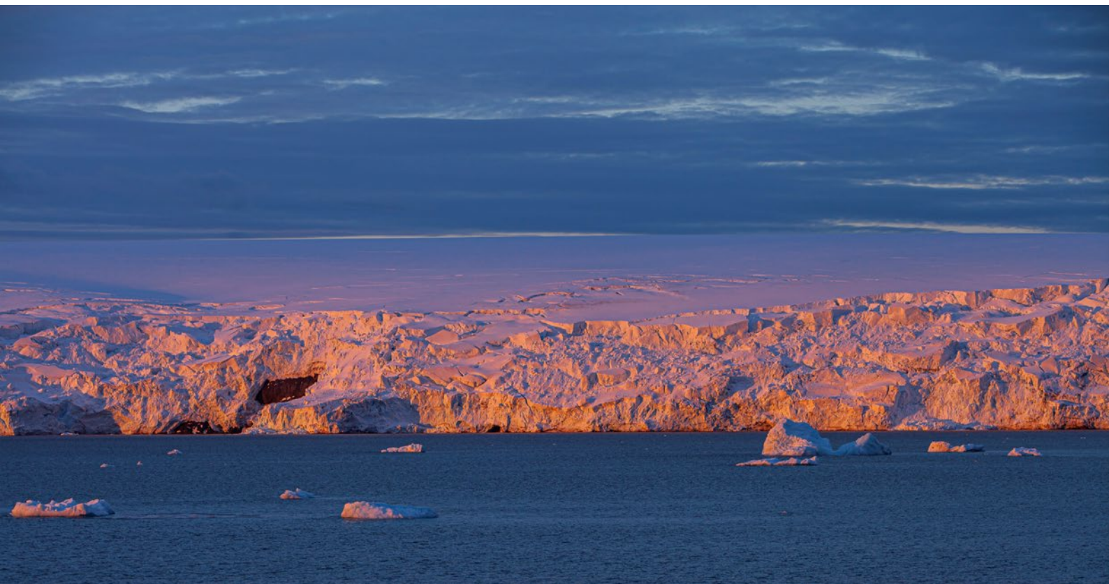
Sunset view of Smith Island.