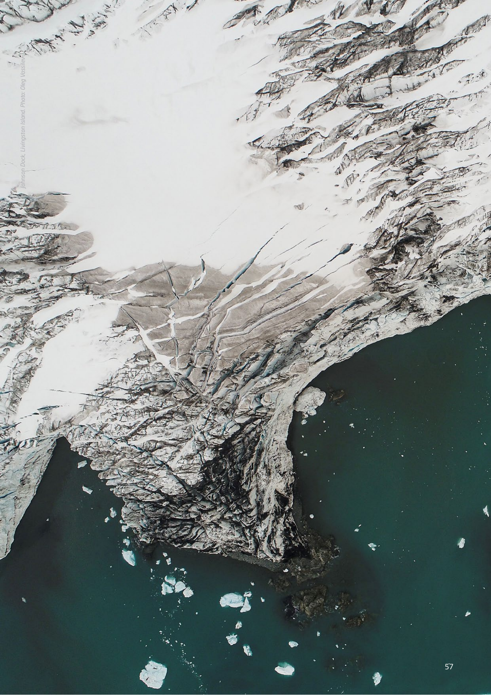
Johnson Dock, Livingston Island.