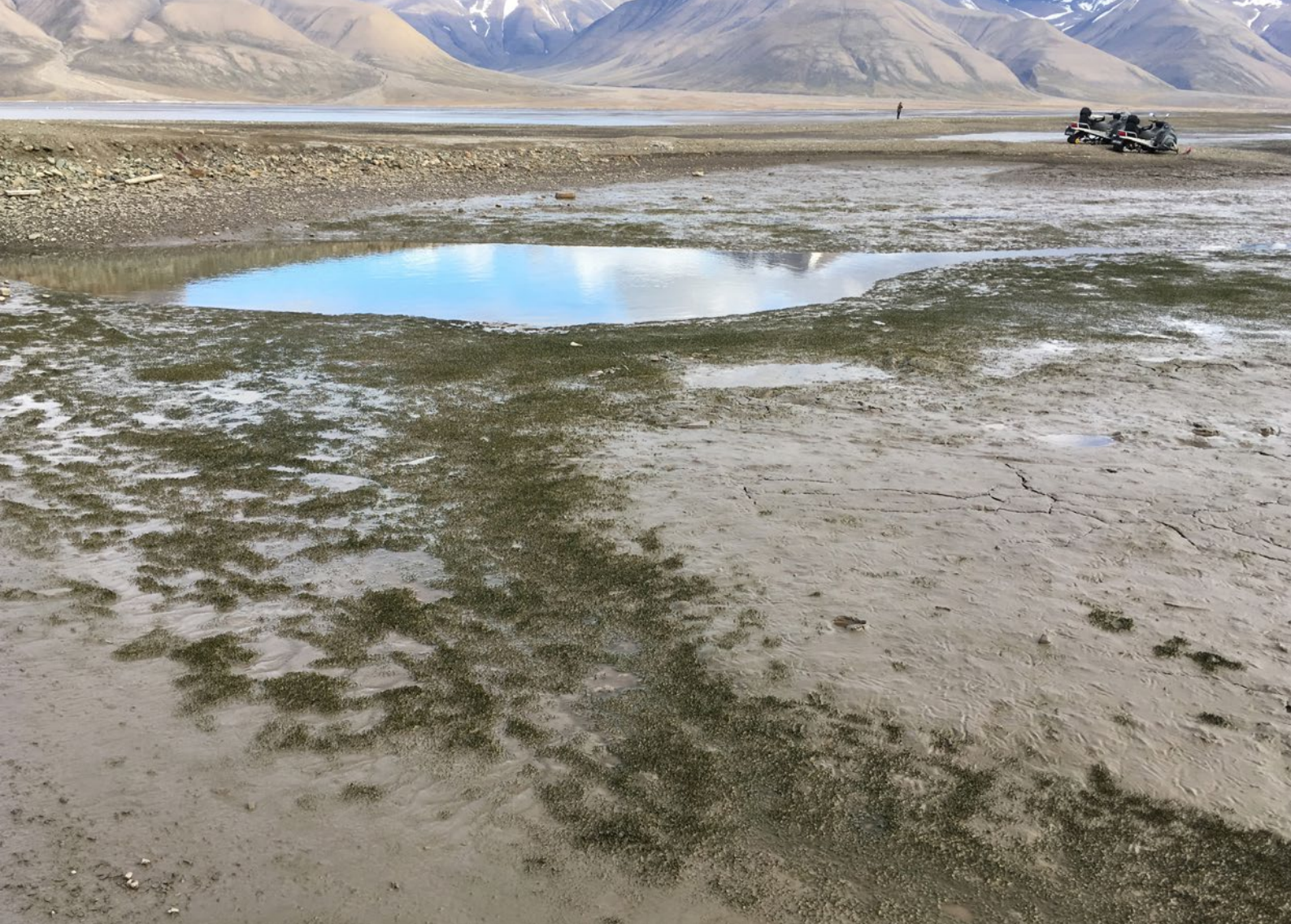
Adventfjord, experimental site - tide flat with invasive algae Vaucheria compacta