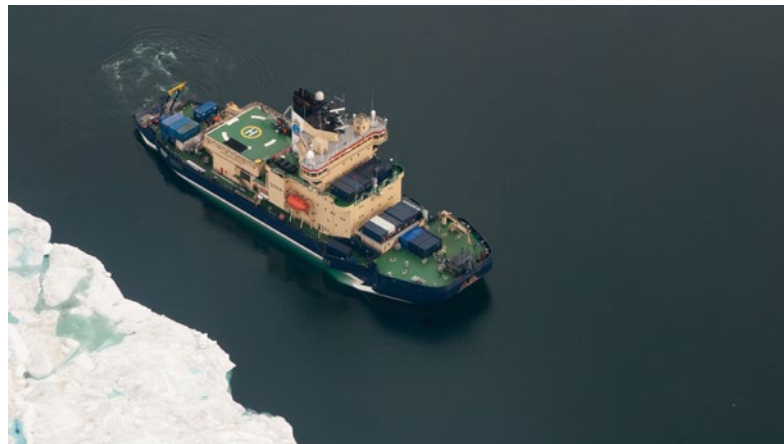
Icebreaker Oden Arctic Ocean.

Tarfala research station is owned and run by Stockholm University. The station is in the Tarfala valley, on the east slope of Kebnekaise massif. The station welcomes scientists and students from national and international universities who wish to carry out research projects or run a course. Information regarding applications for access is provided here .