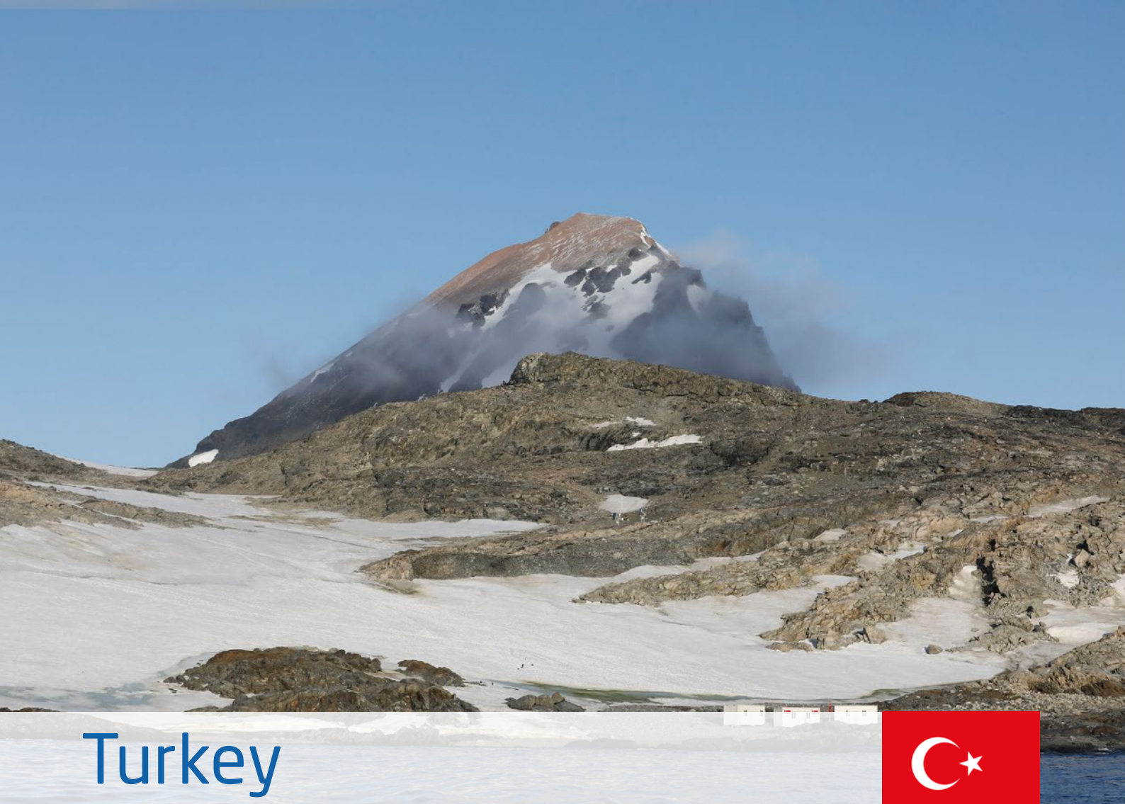
2019-2020 Antarctic Season, Horseshoe Island.