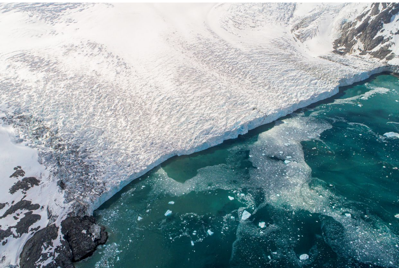
Hunter's glacier, Livingston Island.